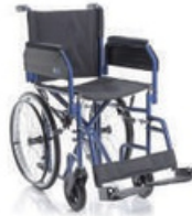
MANUAL WHEEL CHAIR