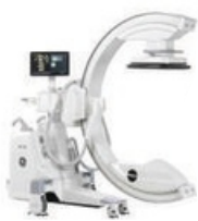
C - ARM