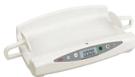
BABY HEIGHT & WEIGHT SCALE