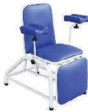
BLOOD DONATION CHAIR