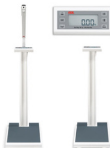
HEIGHT & WEIGHT SCALE