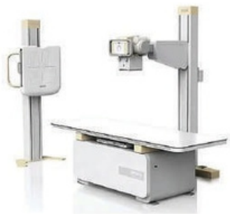
CONVENTIONAL X-RAY MACHINE