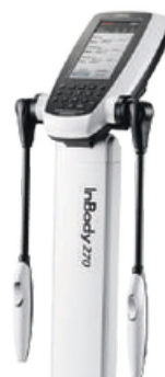
BODY COMPOSITION ANALYZER