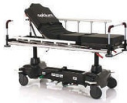
PATIENT TRANSFER TROLLEY