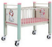
FLAT PAEDIATRIC BED