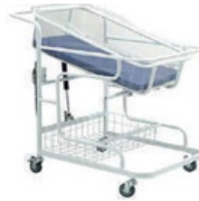
NEW BORN BABY BED