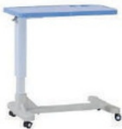
OVER BED TABLE