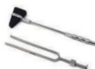
KNEE HAMMER & TUNING FORK