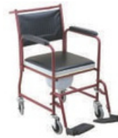
COMMODE WHEEL CHAIR