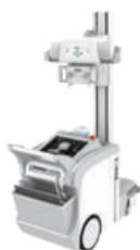
X-RAY MACHINE PORTABLE