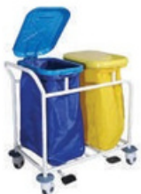
DIRTY LINEN TROLLEY