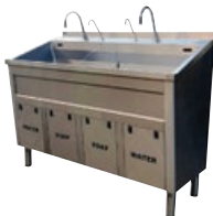
SURGICAL SCRUB UNIT