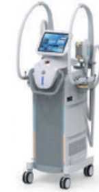
CRYOPOLYSIS FAT FREEZING MACHINE