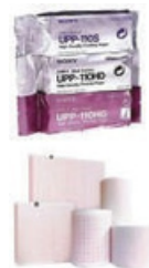
MEDICAL RECORDING PAPERS