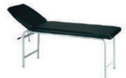
PATIENT EXAMINATION BED