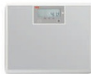
MECHANICAL & DIGITAL FLOOR SCALE