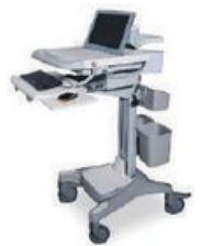
CHECK UP CART