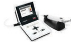
ENDO MOTOR & APEX LOCATOR