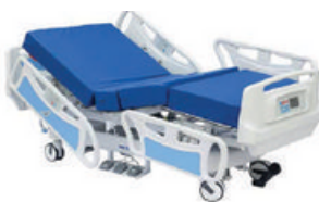
HOSPITAL / ICU BED