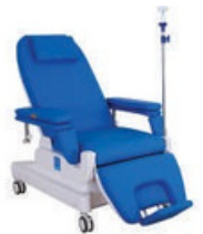
ELECTRIC DIALYSIS CHAIR