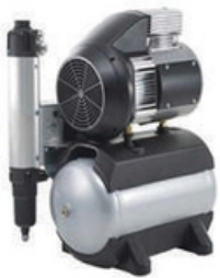
DENTAL AIR COMPRESSOR