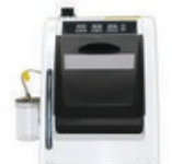
HANDPIECE LUBRICATING MACHINE