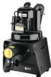
DENTAL SUCTION MACHINE